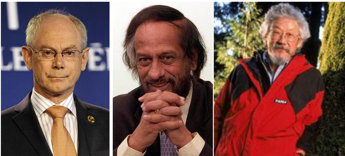
Figure 3: If their “solution” to global warming ushered in a global bureaucracy, people like these would be setting regulations worldwide, with no escape for anyone: The President of the European Council, Herman Van Rompuy, 19 Chairman of the UN’s IPCC, Rajendra Pachauri, and David Suzuki, Canadian conservationist.

If you are an economic member of the regulating class, a global bureaucracy instigated by the alleged need to regulate CO 2 emissions would be terrific: more jobs, power, and money for bureaucrats and their allies. You would be part of what would effectively become a ruling class, free to tax a captive population whatever they could bear and pay yourselves whatever you “know” you’re worth.