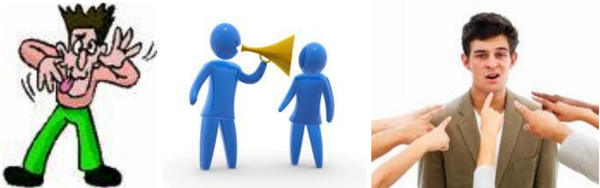
Figure 4: Oppose them, and they call you names. And they own the media.

the mainstream media, they will call you these names in the news and current affairs, newspapers, television, websites, books, movies, and in trendy conversation.