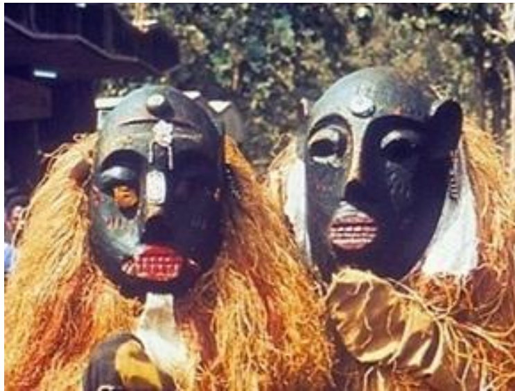
Figure 2: It is one of the oldest scams in human history: witchdoctors go to the rulers and say "the Gods are angry, there will be (more) catastrophes... we know how to appease the Gods, but it will cost you".

All of that national sovereignty would have been ceded to an unelected group of global bureaucrats: Never in the field of human administration would so much power have been transferred by so many to so few. This was a narrowly averted global coup, an attempt to seize a great deal of power by stealth without the knowledge or explicit consent of the world's people. It can only have been kept silent with the active support of the world's media. But because of that silence, the coup has never been acknowledged, so the people of the world are unaware of it and further attempts could be made. Climate "science" is clearly flawed, but it is an excuse for a massive power play.