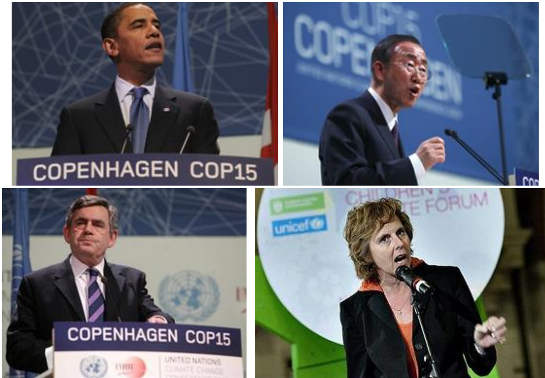
Figure 1: The regulating class at work in Copenhagen. President Obama of the US, Ban Ki-moon the Secretary General of the United Nations, British PM Gordon Brown, presided over by Connie Hedegaard, the Danish climate and energy minister.

The draft Copenhagen Treaty is still available in a few corners of the Internet. 16 It is 181 pages of dense, convoluted, bureaucratic language, slow and difficult to read. The draft contains options and blanks to be filled in. Nonetheless, it is clear enough.