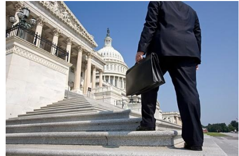
Figure 5: Getting the information through: printing press (1440), Internet (1990), and the Lobbyist's briefcase. 23

The skeptics have also won in the legislatures. Governments nearly everywhere are backing off, with only Europe, Australia, and New Zealand imposing regulations to reduce CO 2 emissions (only Australia's are meaningful and punitive, and only because the Greens temporarily hold the balance of power). How did the skeptics win? By walking the data through to the legislators in lobbyist's briefcases , bypassing the block that is the mainstream media, and in many case penetrating the smears and disinformation intended to inoculate the legislators from anything skeptics say.